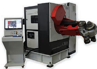
CNC bender with an eccentric head ...46