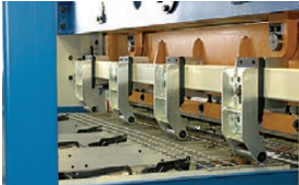
Welding machine mesh feed system (above) and machine's welding portal (below) ...36