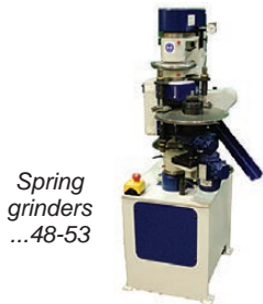
Spring grinders ...48-53