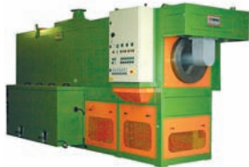
Drum washer for springs and wire formed parts...30