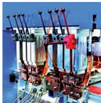
Compact mesh welding cylinder...36