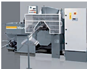
Versatile system for producing wire hangers....38