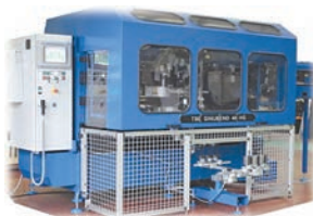
System for making square sinuous wire forms...38