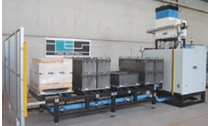
Unattended automatic heat treatment...29