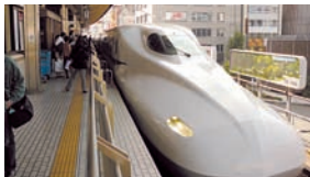
Riding the "Bullet Train" through Japan...50