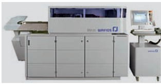
CNC single-head bending/coiling machine....19