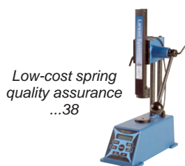
Low-cost spring quality assurance ...38