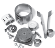
A variety of spring solutions ...40