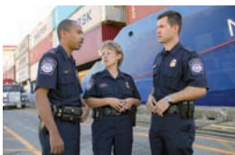
Policing antidumping duty violations...12