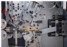
High-speed spring coiling with advanced software...50