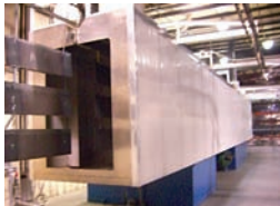
Powder coating technology...10