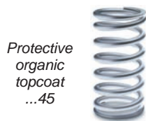
Protective organic topcoat ...45