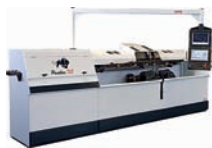
Twin-head CNC wire forming machine....39