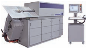
Universal wire bending system....18