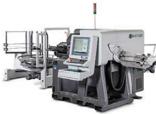
All-electric CNC wire bending machine....26