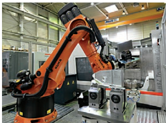
New robot/machine communications standard ...36