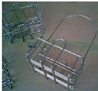
Advanced bending and forming capabilities ...39