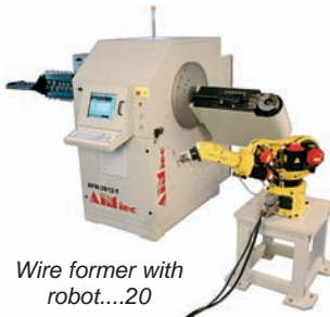
Wire former with robot....20