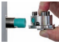
Bending tool with integrated RFID chip....18