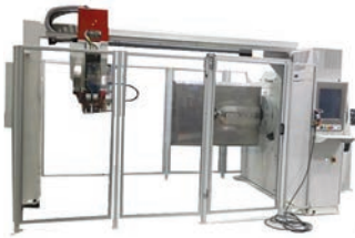
Flexible automated bending system...16