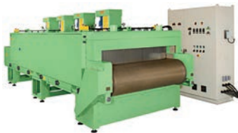
Large-size conveyor oven... 19