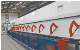
Cold forming line for ribbed rod...32