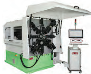
Advanced features in spring and wire forming ...28