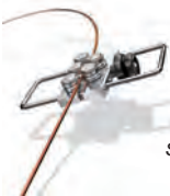
Hand-held straightener ...69