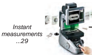
Instant measurements ...29