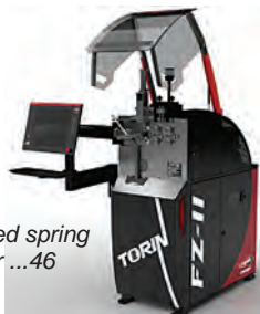
Enhanced spring coiler ...46